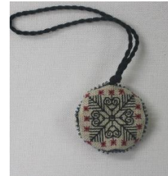
Biscornu fob with beaded trim counted thread