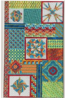
Confetti Intermediate canvas