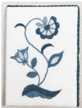
Blue & White Huswife Crewel