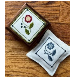
A Taste of Crewel Crewel