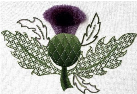
Prince's Thistle Crewel