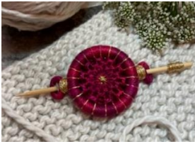
Dorset button/ shawl pin surface embroidery