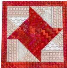
Whirligig canvas (basic/intermediate)