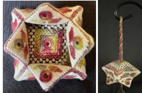
Lotus Drop Ukrainian Whitework