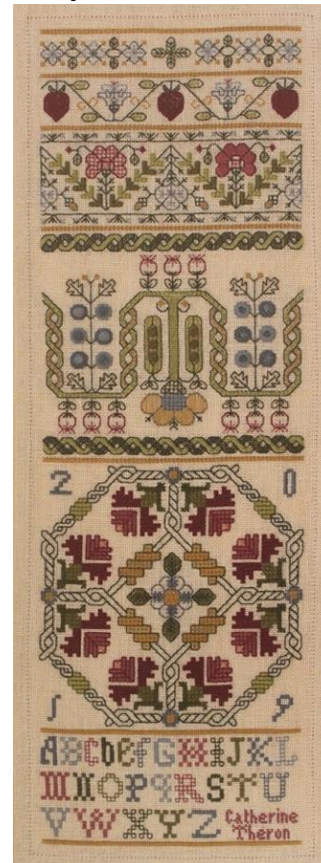
Flowers & Berries Band Sampler counted thread