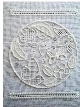
Butterfly & Blooms Pulled thread, counted whitework