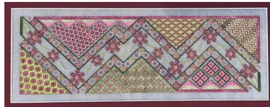
Blossom Time canvas (intermediate)