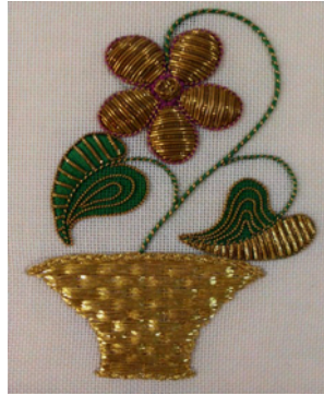
302 Golden Petals Teacher: Toni Gerdes