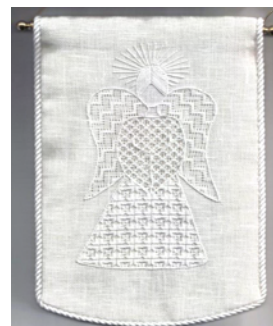
103 Pulled Thread Angel Teacher: Rozelle Hirschfelt