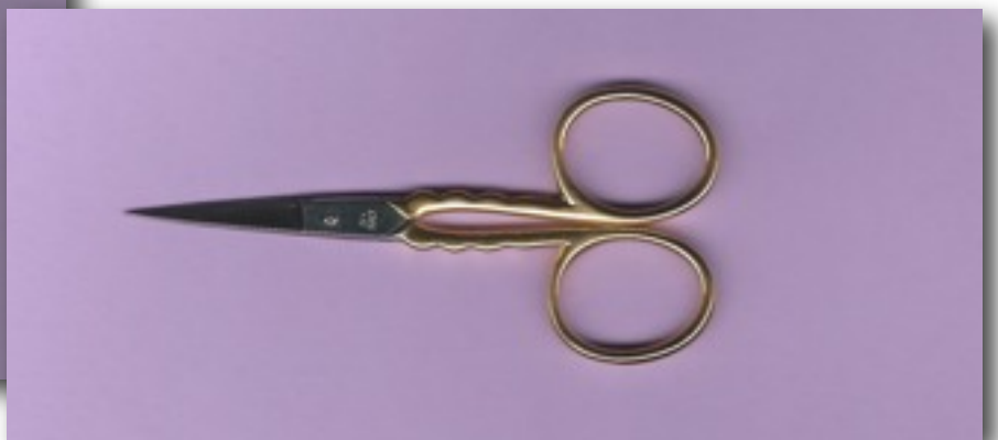
Pocketful of Posies Deanna Powell