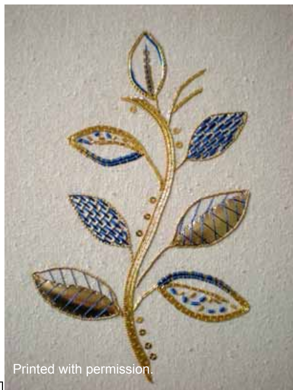
Printed with permission.

Marilyn Doyle is offering a new gold-work class that members would be able to do in a group, run much like a correspondence course. The cost would be $37 which will cover the cost of materials and a framed silk ground. More details on the where and when to follow. If you are interested in this extra workshop, please sign up by calling Karin Finkel at (734) 552-6933.