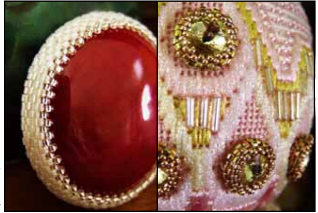
Printed with Permission