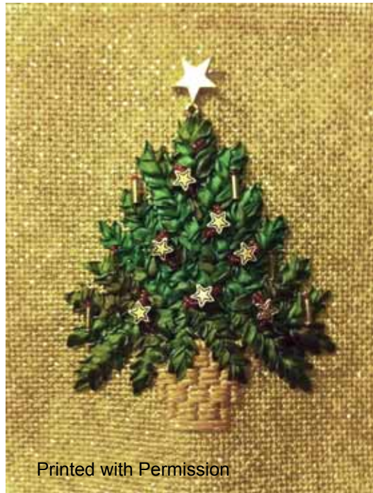
Printed with Permission